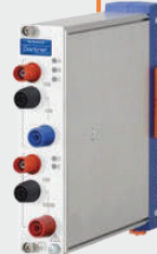
Q.boost Up to 4 MHz per channel, triggered or continuously