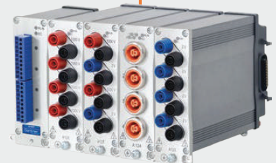
Q.series X Up to 100 kHz per channel