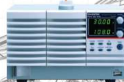
PSW-Series Wide Range Output DC Power Supply