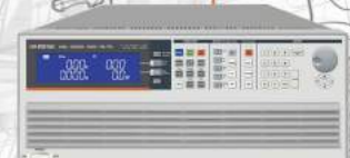
AEL-5000 Series 22.5kW High-performance AC/DC Electronic Load