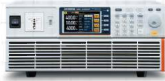
ASR-2000/ASR-3000 Series 500VA-4KVA AC/DC Power Source