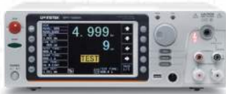
GPT-12000/9000 Series 200VA/500VA Safety Analyzer