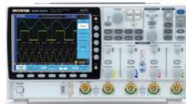
GDS-3000A Series 650MHz /350MHz BW, 2 Input Channels, 5-2.5GSa/S