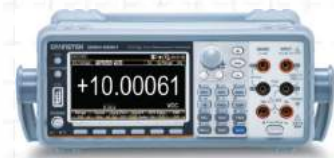
GDM-906x Dual Measurement Multimeter Vehicle Temperature Measurement and Monitoring Solution