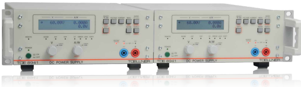
19" adapter, TOE 9522

Free drivers for LabView™ at www.TOELLNER.de